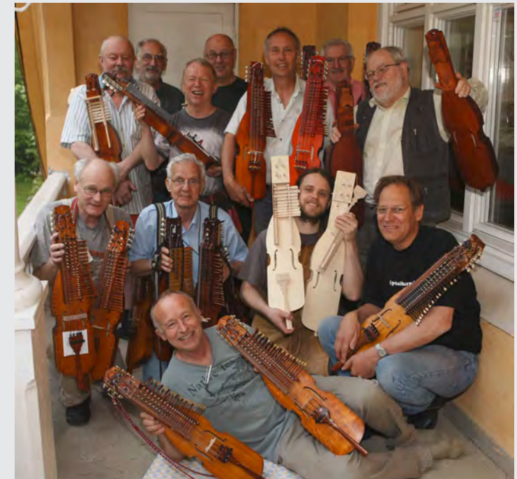
The Eric Sahlström Institute initiated a project with the aim of making 25 child-sized nyckelharpas. The reduction factor is 0.85 which gives a 340 mm string length. Picture taken from one of the last meetings at the Institute early Summer 2010.