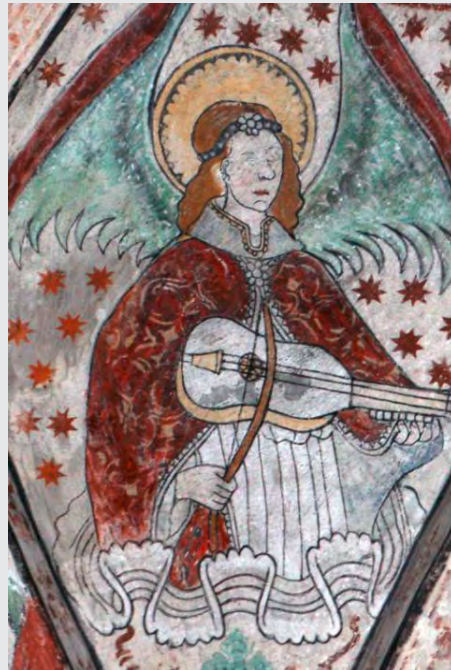
Ålkvarleby church in Uppland, Sweden. Angel with nyckelharpa, Fresco c. 1500