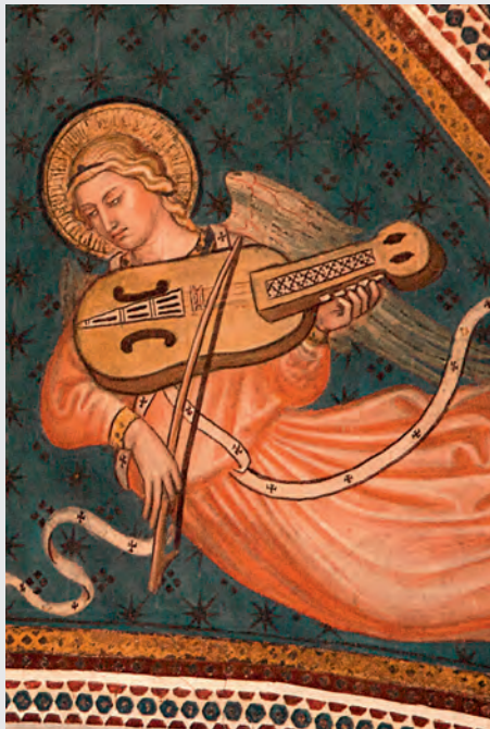
Cappellina di Palazzo Pubblico, Siena, Italy. Angel with "Viola a chiavi", Fresco by Taddeo di Bartolo, 1408

The nyckelharpa (keyed fiddle, Schlüsselfidel, vielle à clefs) was chosen as the unifying music tool in the project CADENCE, Cultural ADult Education and Nyckelharpa Cooperation in Europe. The reason for this is that the instrument exists today in all three countries involved in the project: Sweden, Italy and Germany. The revival of the nyckelharpa in Germany, and Italy in particular, has only occurred relatively recently. I will give a short explanation of the history of the instrument and how, in recent times, its use has spread all over the world. An overview of how the instrument was made in historical times and how it is made today is included.