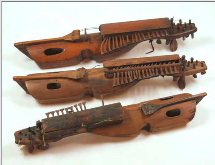
Three very old kontrabasharpas stored at the Music and Theatre Museum in Stockholm. They are all made out of one spruce log. The tops are carved to the correct radius and not steamed.

ants of gammelharpas are the kontrabasharpa which existed from the early 17th century until the beginning of the 1930s and the silverbasharpa which appeared around the mid-1800s and remained popular until 1940. The kontrabasharpa was a fully chromatic instrument and some instruments were provided with quarter notes.