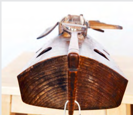
Observe the slanted sides and the acutely curved top which follows the annular rings