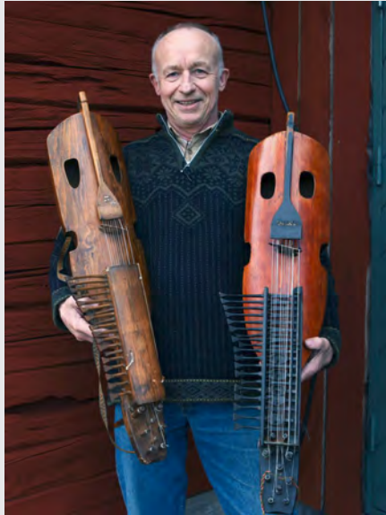
The photo above shows the author with two "real" gammelharpas. To the left a kontrabasharpa dated c.1780 and to the right a silverbasharpa dated c. mid 19 th century. In spite of their age both instruments are in very good condition and can still be played today.

The old Swedish nyckelharpa with its long narrow design was quite different from the